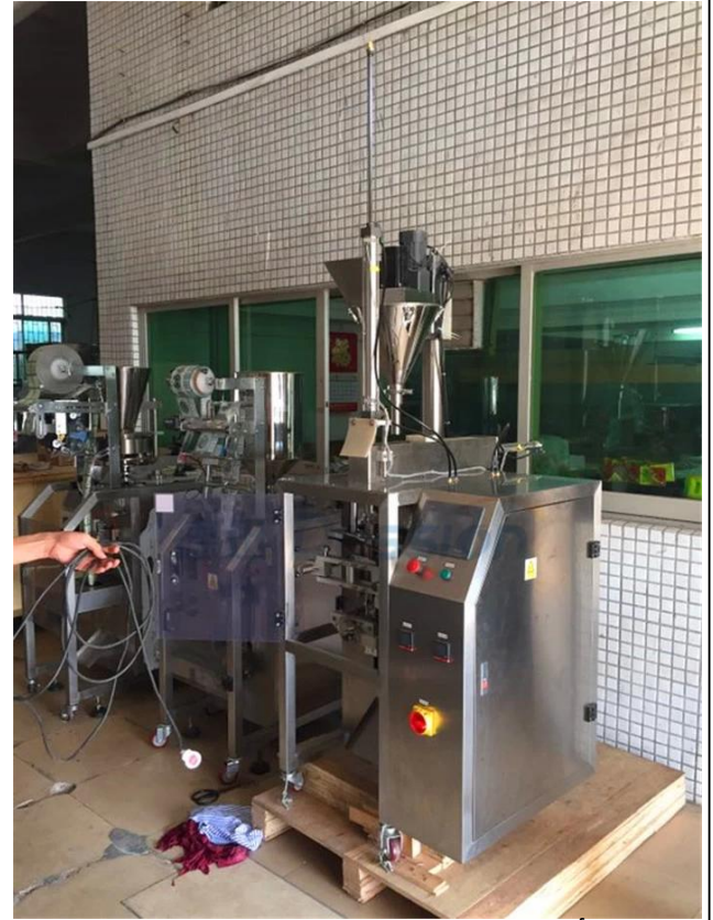
الجانب الأيمن من الماكينة