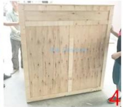
Automatic perforating tea bag and instant coffee machine packing