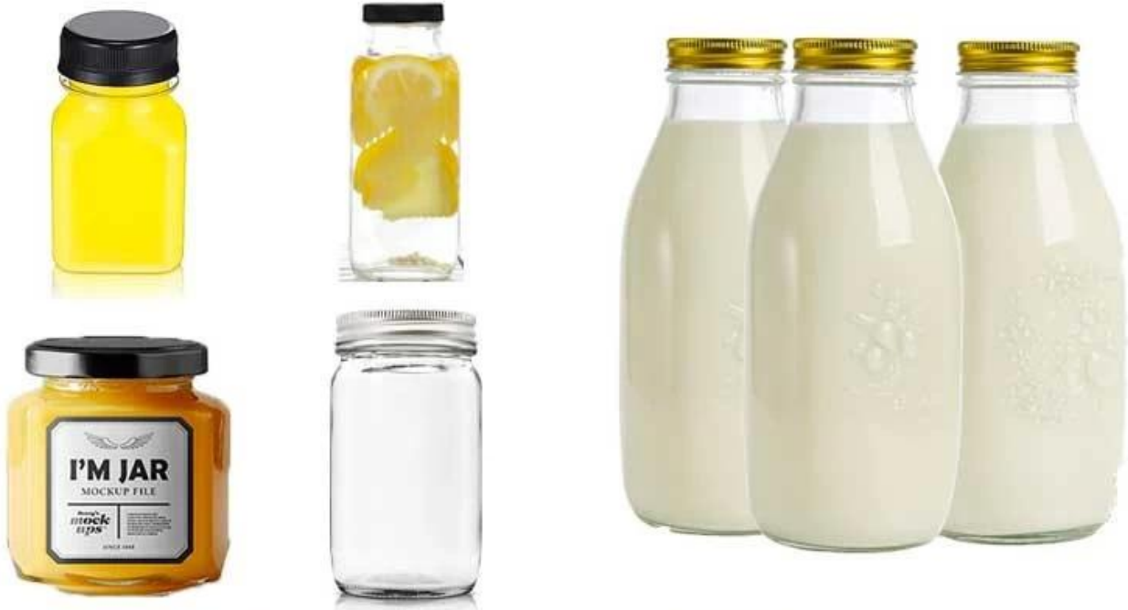
Figure 1 shows various application scenarios for the machine, including different bottle shapes, sizes, and colors, as well as different liquid contents and labels.