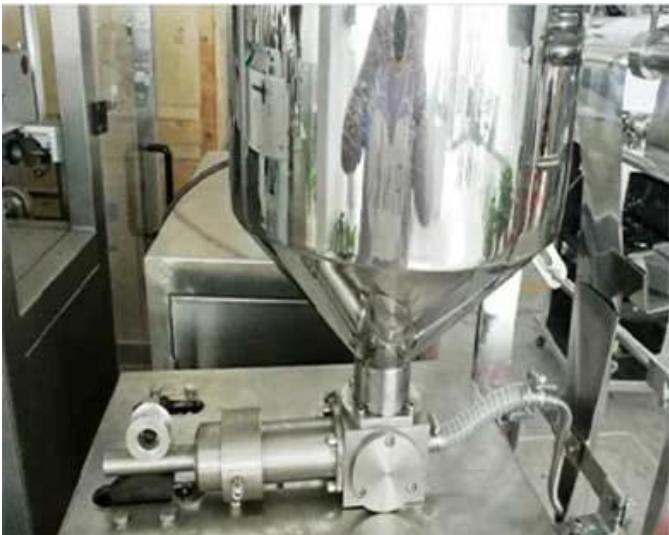
工业级 304 不锈钢 漏斗 适用于各种工业用途 如 食品 医药 化工 等。材质 SS304。耐腐蚀 易清洗 使用寿命长。