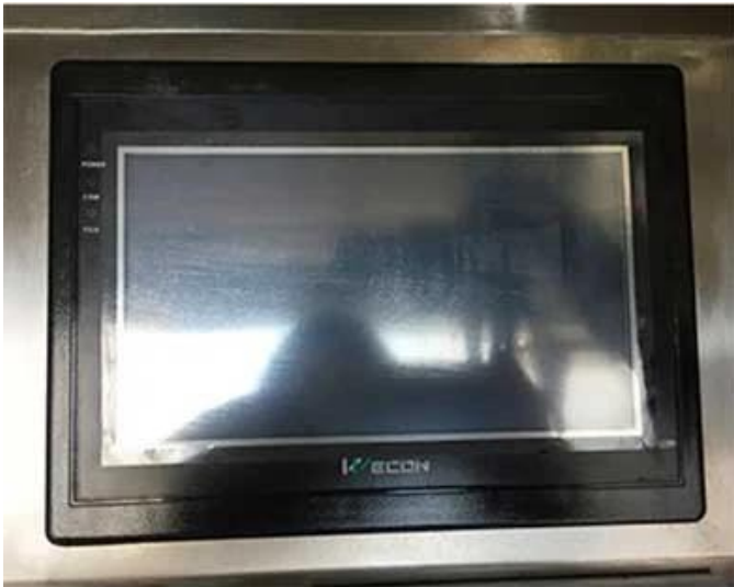
15.5" 工业显示器 1080P 分辨率 16:9 比例 适用于工业环境。坚固耐用 易于安装 维护 简单。