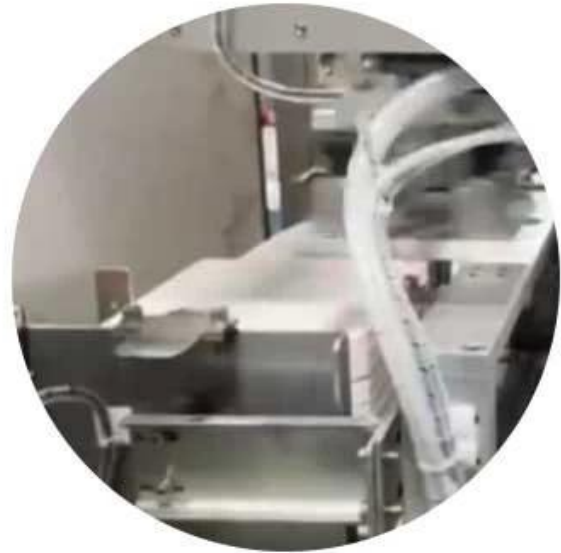
Vacuum suction box

Envelope shape holder, can be customized, according to the size requirements to customize the desired shape