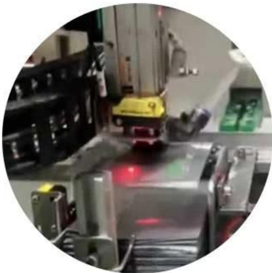
Vacuum suction device

With adjustment function, adjust and customize according to needs