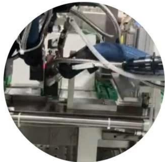
Sealing, spray glue

Electric eye induction, vacuum adsorption