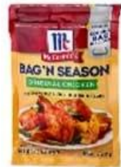
3/4 side seal bag