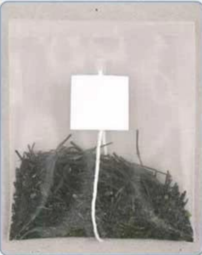
Flat Tea Bag