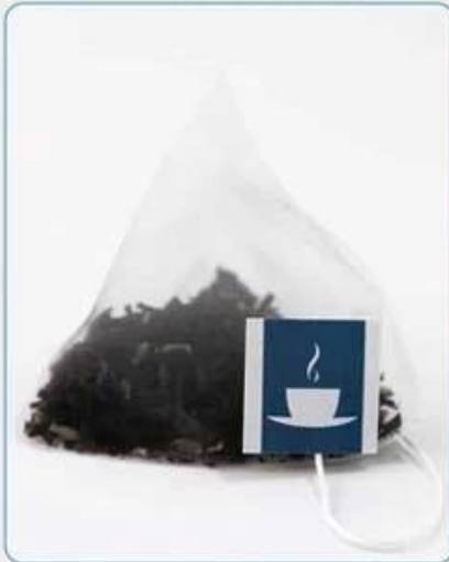
Pyramid Tea Bag