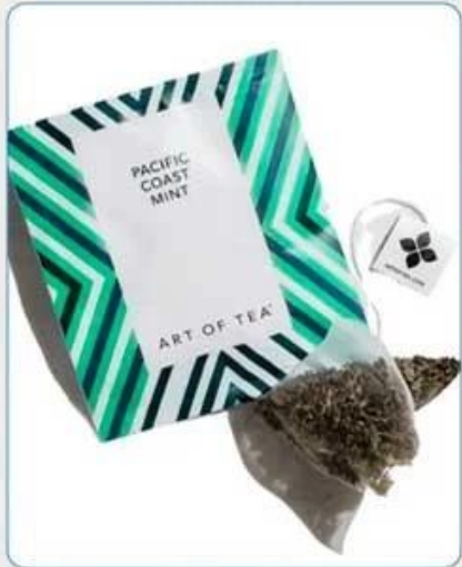
Tea Bag With Envelop