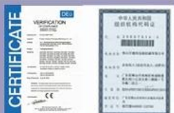
Tight quality control