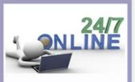
7-24 Hours services