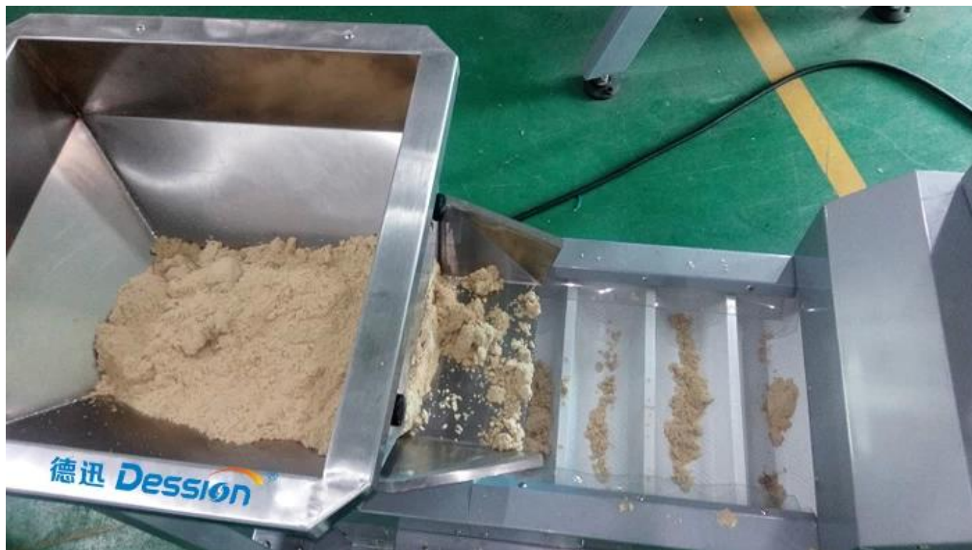
Packed item 2 Hopper and goes in