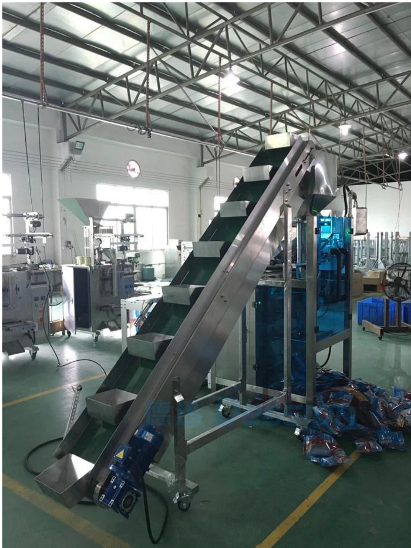
Packed Item 1 goes in