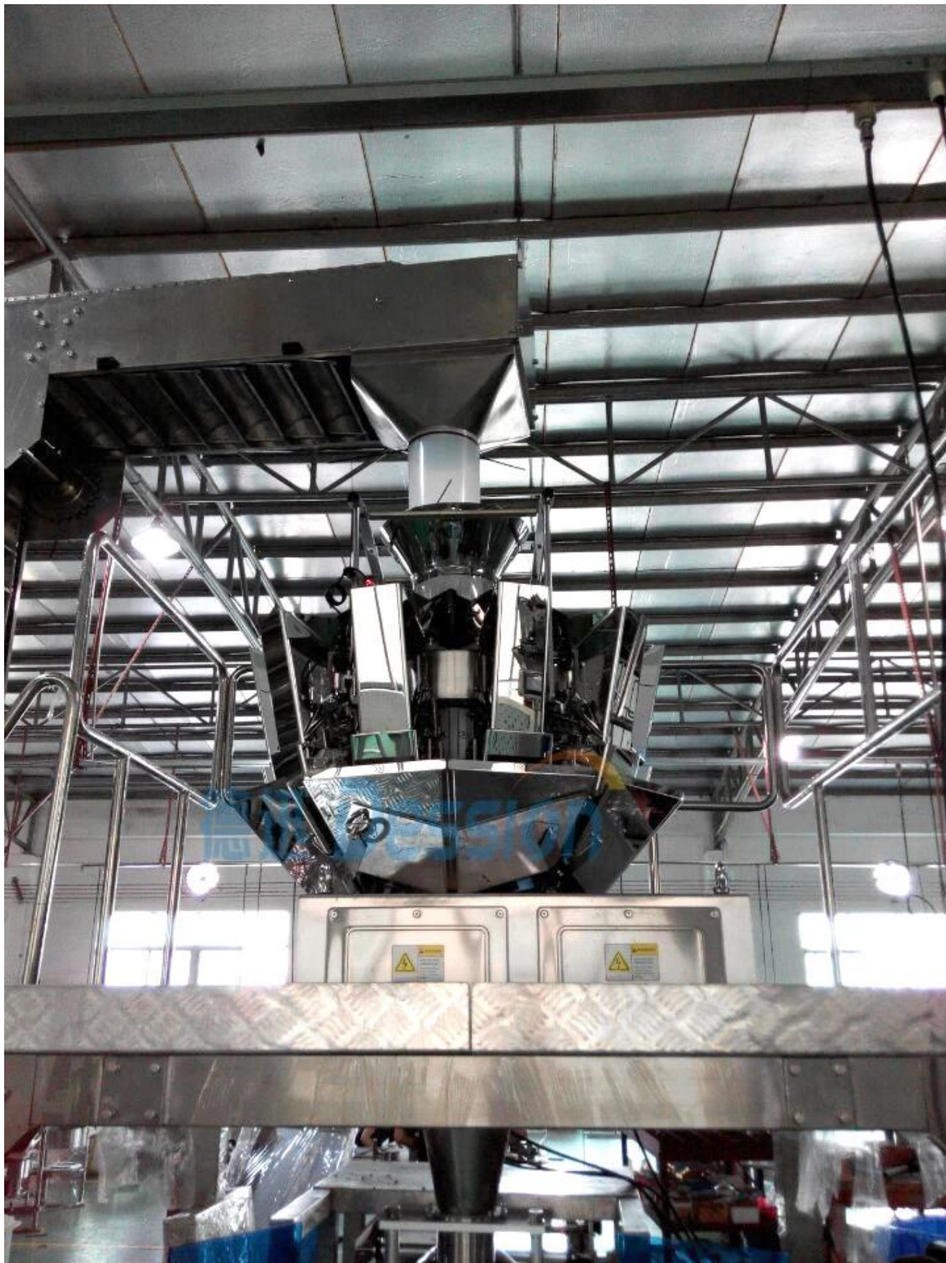
Multi Heads Weighing