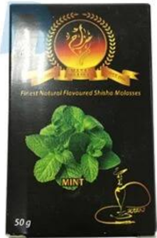
Tobacco back seal inside and outside packaging

Introducing Dession electrical accessories