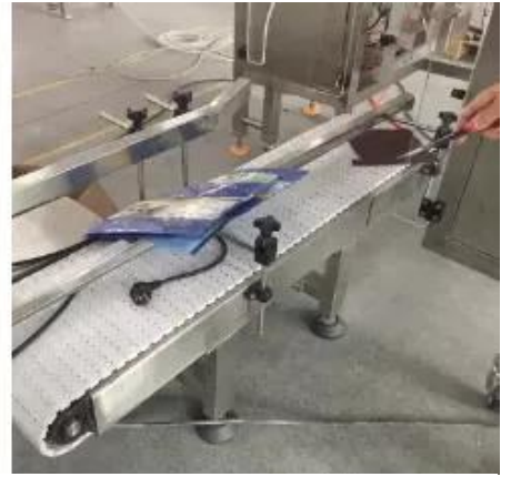
Finished product conveyor