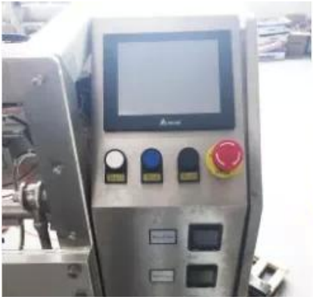
Touch screen control Language can be customized.