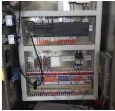
Imported electrical parts PLC control, inverter