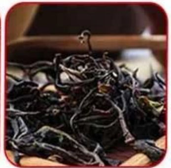
Ceylon black tea