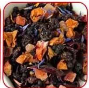
Particles of tea