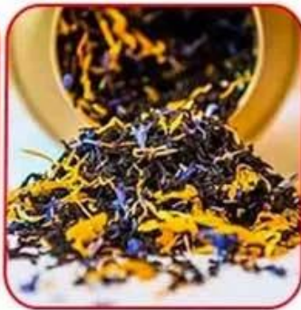
Earl Grey Tea