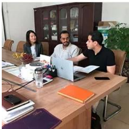
Collect Customer Needs