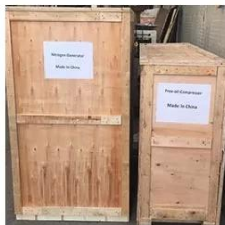
Wooden Box Packing