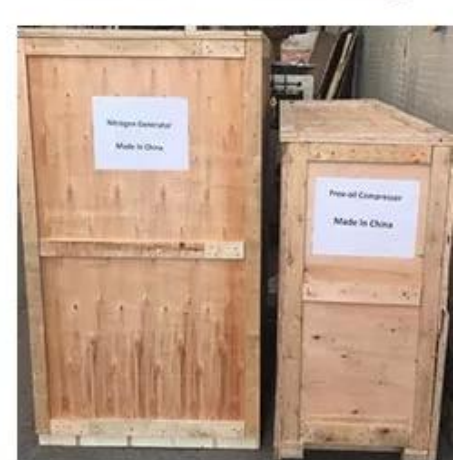
Wooden Box Packing