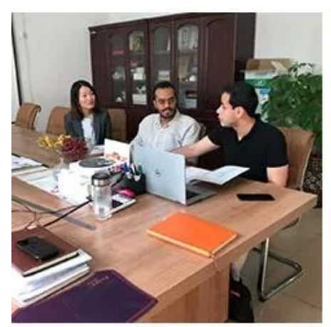
Collect Customer Needs