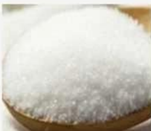
refined cane sugar