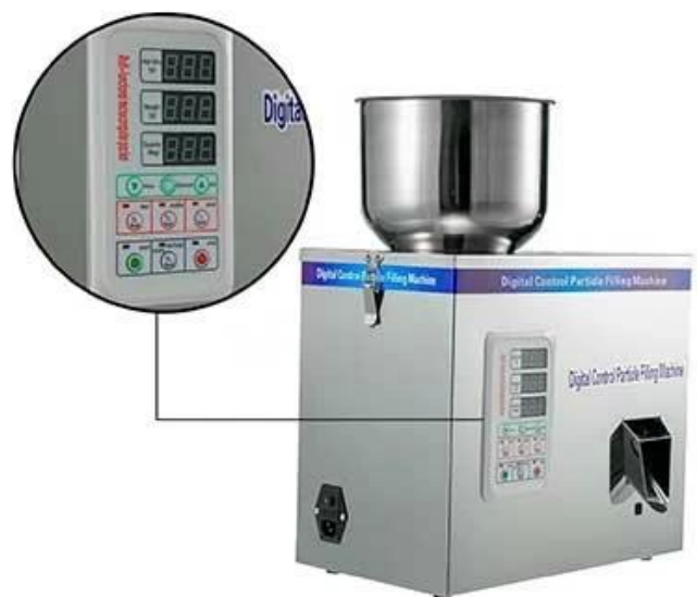
INTELLIGENT CONTROL PANEL

The data mouth will connect with a sealing machine.