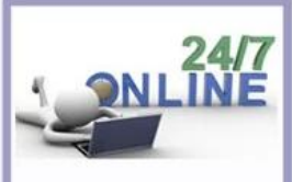
7-24 Hours services