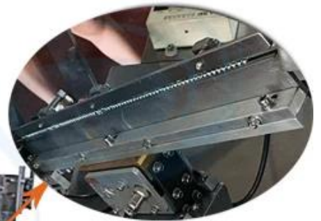
Precise Skid Trail