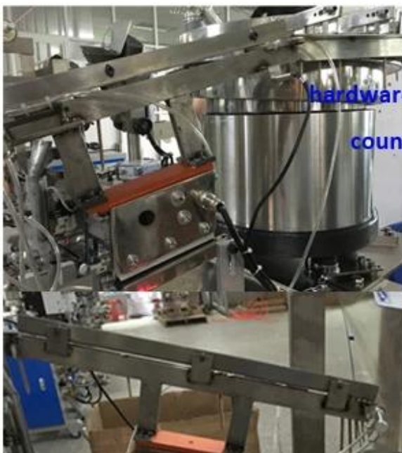
hardware screws/nuts/bolts nails/fastener, counting package solution