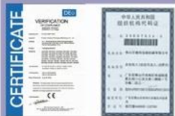
Tight quality control