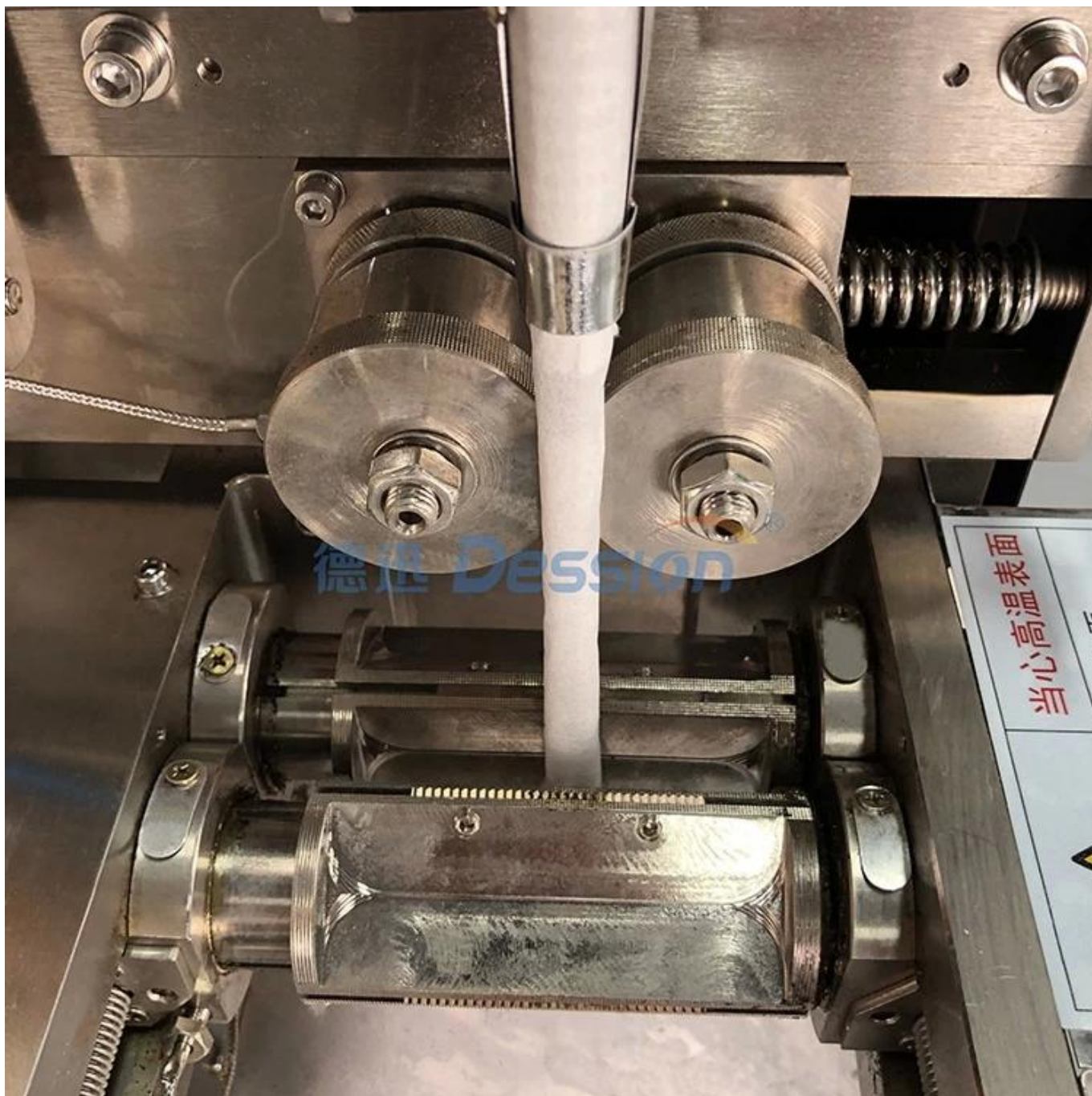
Bag sealing and cutting device