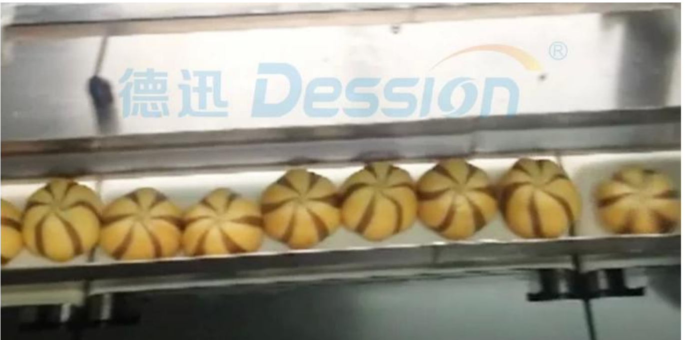
3.Packed item goes through from turnplat to bag forming device