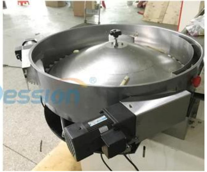
2.Packed item goes into the turnplat