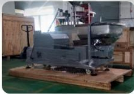
Wapping the Machine