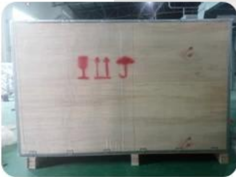
And Put into Wooden Case