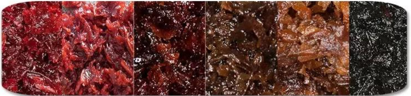
Shisha Tobacco Materail

Dession شيشة شيشة شيشة شيشة shisha, شيشة, شيشة شيشة شيشة شيشة شيشة شيشة شيشة شيشة.