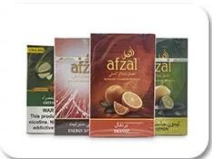
Cellophane & Tear Line Wrap