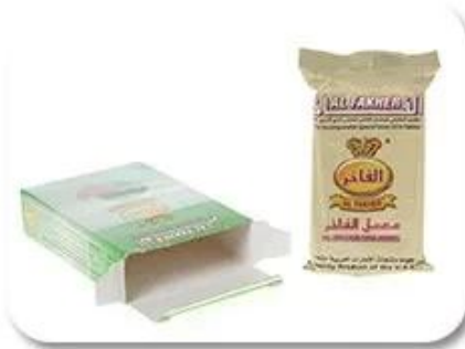
Bag Into Box