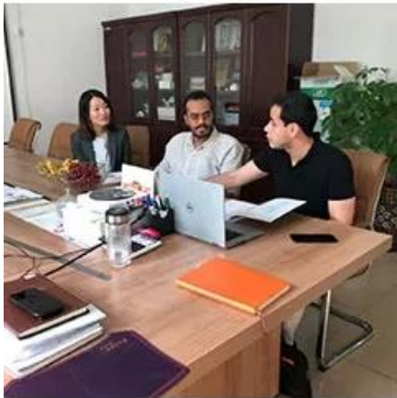
Collect Customer Needs