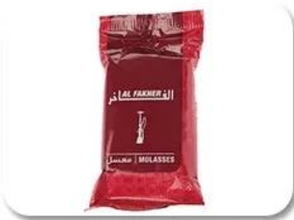
Plastic Bag Packing