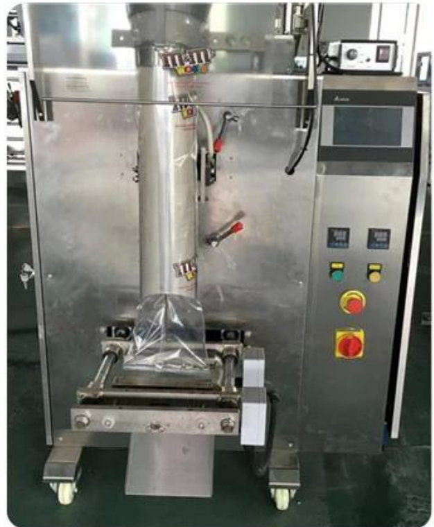
Bag sealing and touch screen