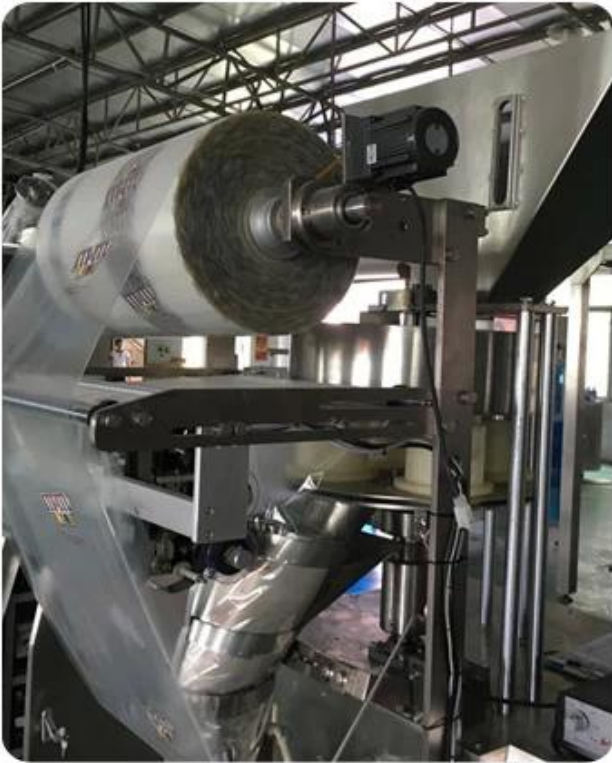
Roll of film for bags