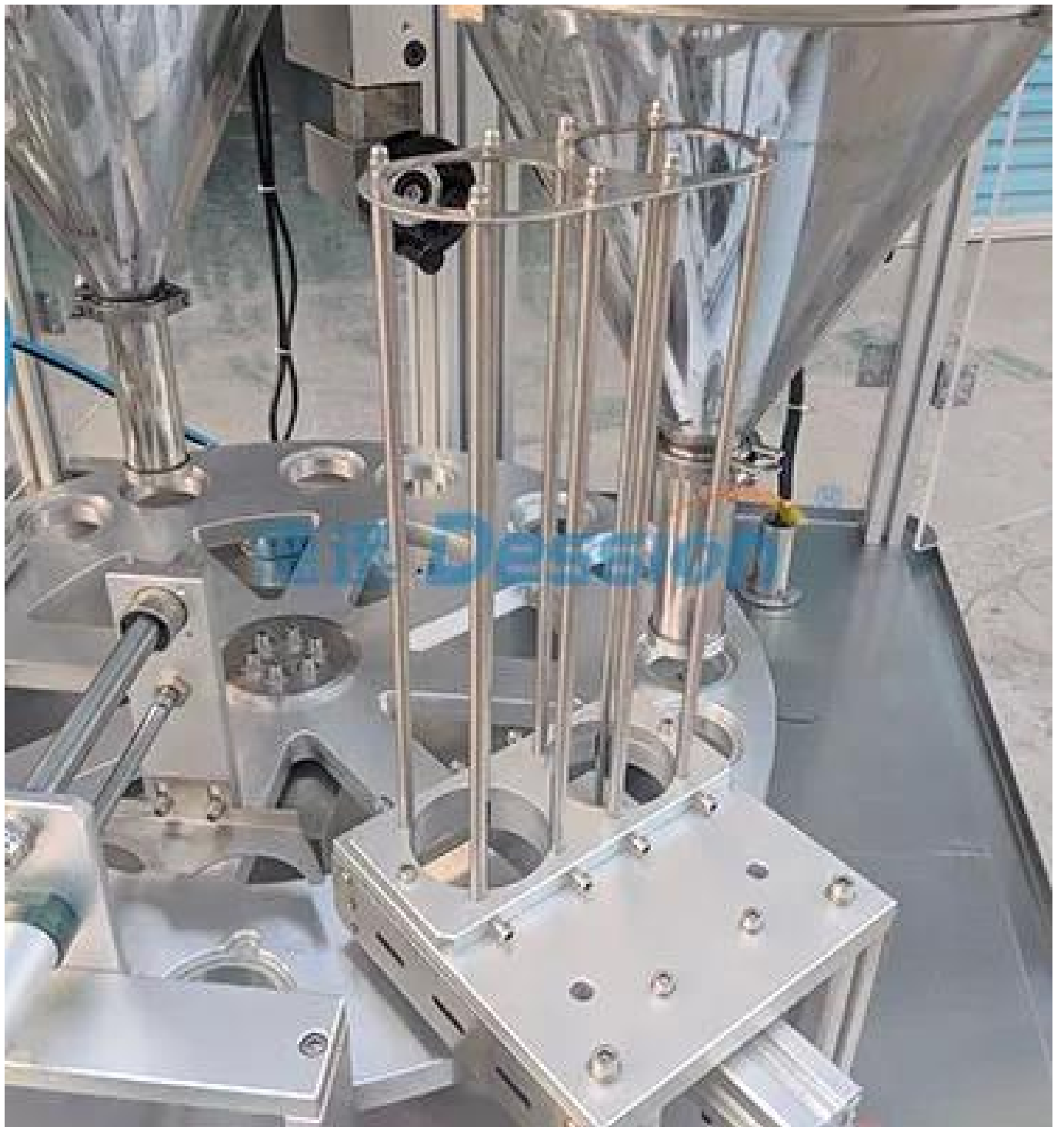
Tablet Press Machine A pharmaceutical tablet press machine used for manufacturing tablets.