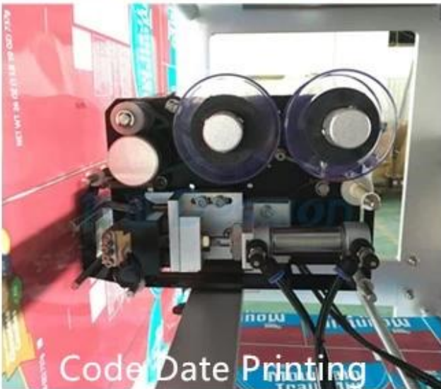
Code Date Printing