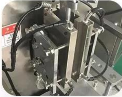
4 Sides Sealing Device