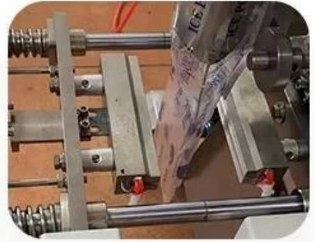
Linking Bag Device