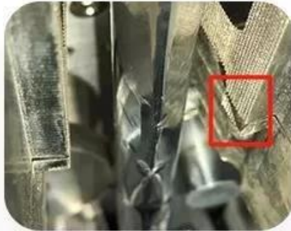
Easy Tearing Device