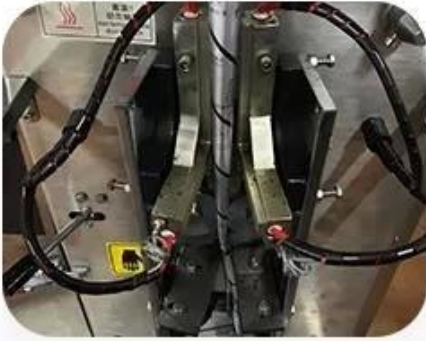
3 Sides Sealing Device