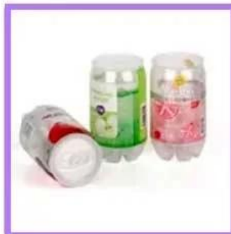
Jar & Can