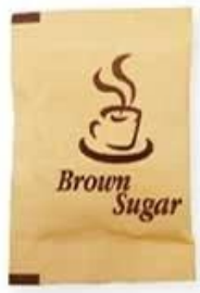
3 SIDE SEAL