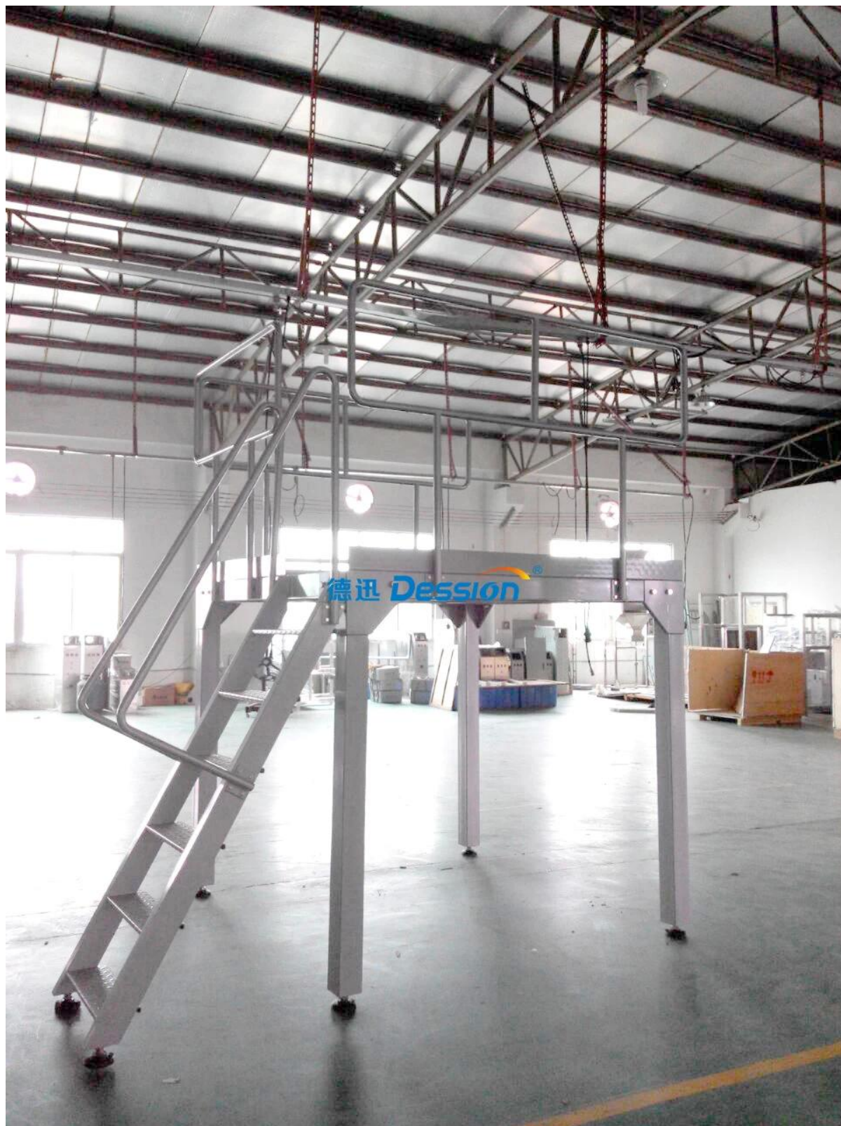
4.2 平台秤 (德迅 Dession)