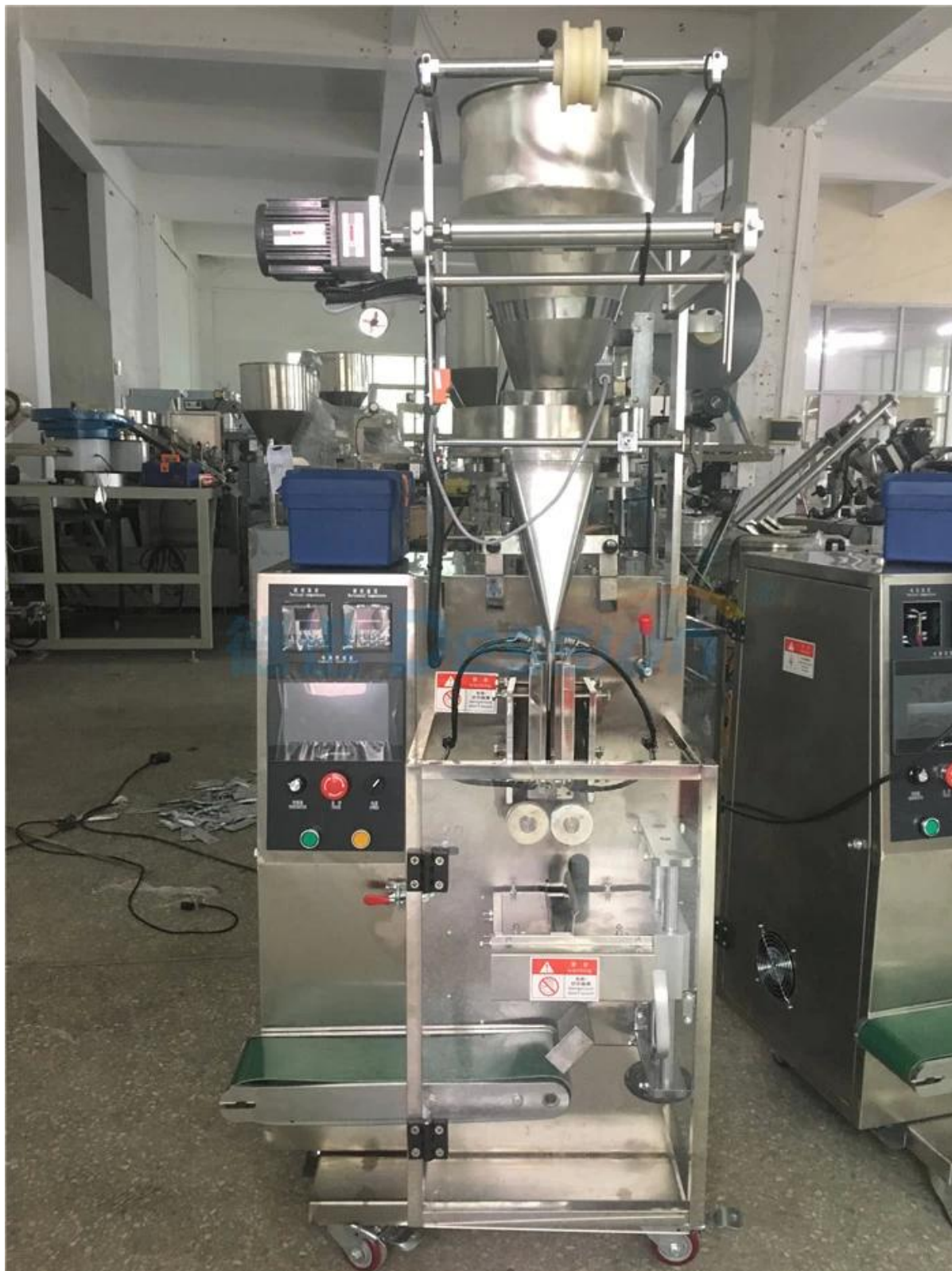
圖 圖 圖 圖: