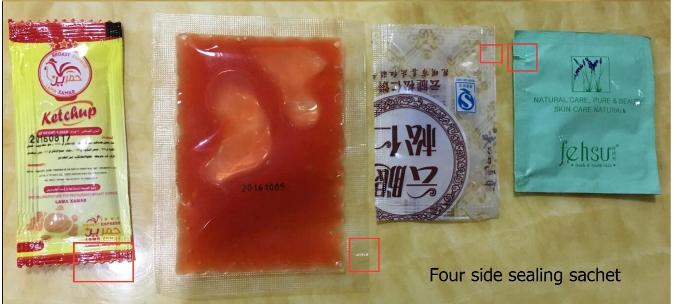
Four side sealing sachet