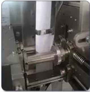
Inner bag sealing device