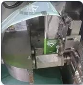
Outer bag sealing device