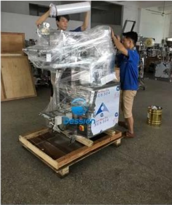
圖 1 為 貨 物 裝 箱 的 第 一 步 驟， 工 人 將 貨 物 裝 入 木 箱 中， 並 用 膠 帶 封 口。