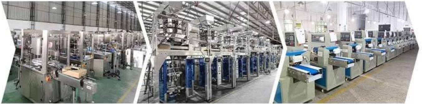
FILLING MACHINE WORKSHOP