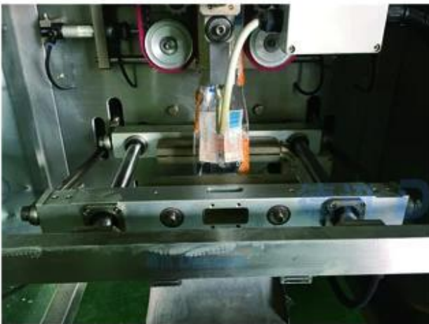
CUTTING AND SEALING PART