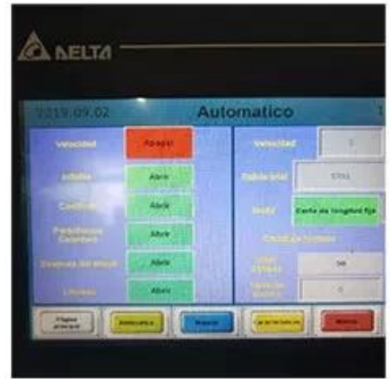
Touch Control Screen