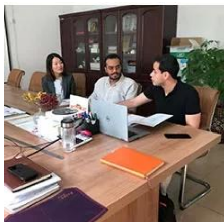
Collect Customer Needs

Dession 〇〇〇〇 〇〇〇 〇〇 〇〇〇〇 〇〇〇〇 〇〇 〇〇 〇〇〇〇 〇〇〇〇. 〇〇〇〇〇 〇〇〇 〇〇 〇〇〇 〇〇〇 〇〇〇〇 〇〇 〇〇〇 〇〇〇〇 〇〇〇〇〇. 〇〇〇 〇〇〇 〇〇〇 〇〇〇〇 〇〇 〇〇 〇〇 〇 〇〇 〇〇〇〇 〇〇 〇〇 〇 〇〇〇 〇〇〇〇〇〇 〇〇〇 〇〇〇〇. 〇〇〇 〇〇〇 〇 〇〇 〇〇 〇〇 〇〇〇〇 〇〇〇〇 〇〇〇〇〇. 〇〇〇 〇〇 〇〇 〇〇 〇〇〇 〇〇 〇〇 〇〇 〇〇 〇〇〇 〇〇〇〇〇〇〇.