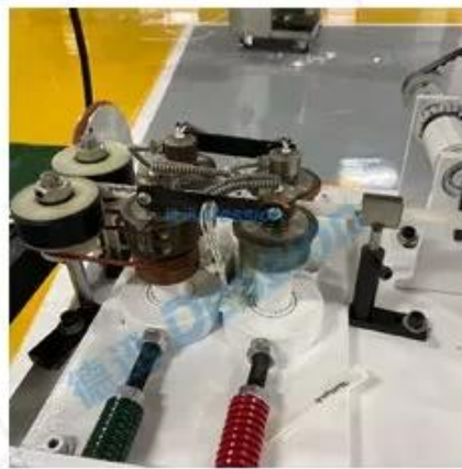
Bag sealing device