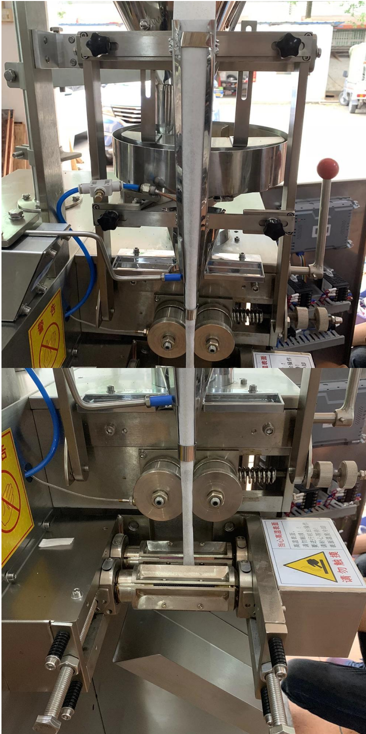
Bag Forming Shoulder Bag Sealing & Cutting Bar