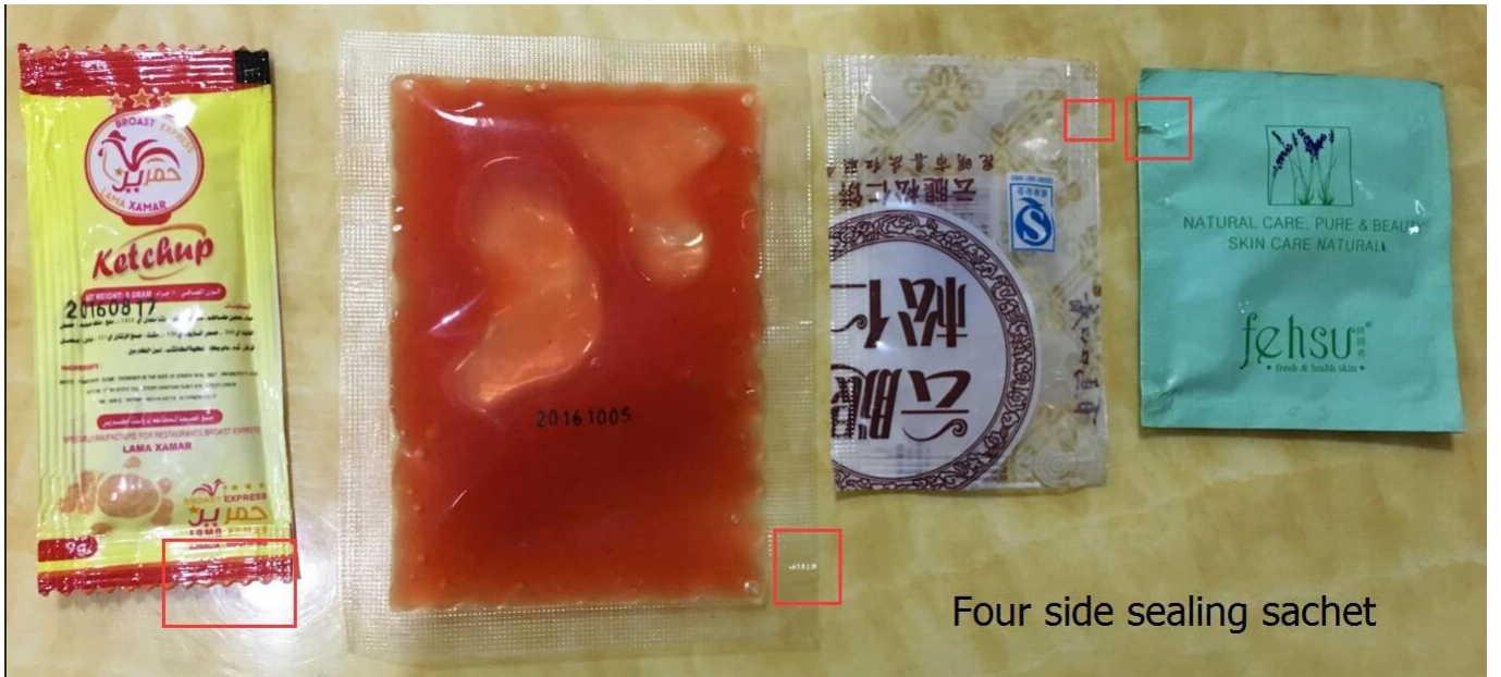
Four side sealing sachet