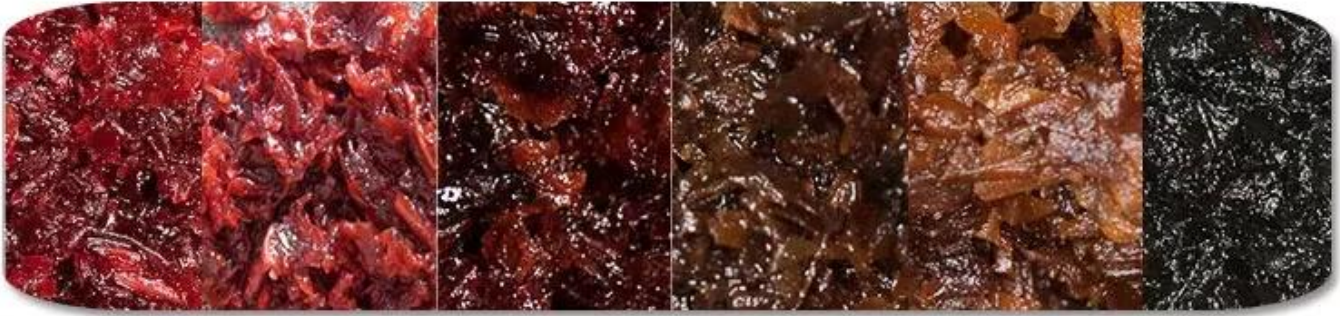
Shisha Tobacco Materail

Dession مادة التبغ مادة التبغ الشيشا, مادة التبغ, مادة التبغ مادة التبغ مادة التبغ مادة التبغ.