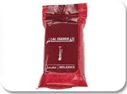
Plastic Bag Packing