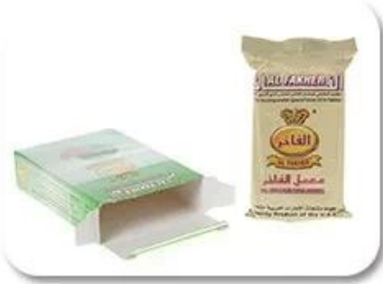
Bag Into Box