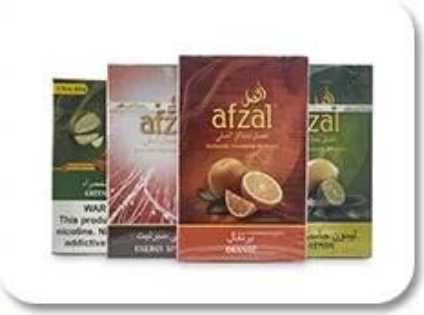
Cellophane & Tear Line Wrap