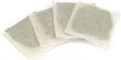
Square/Pillow tea bag