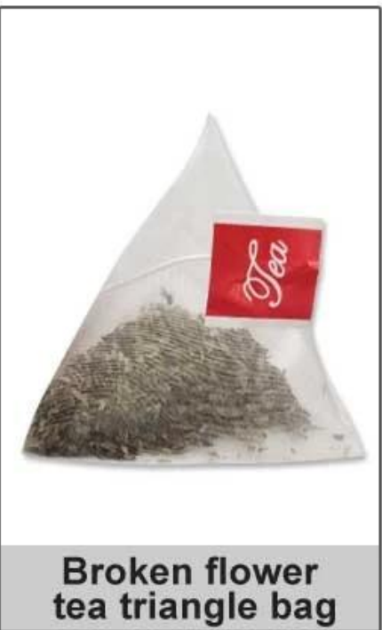
Broken flower tea triangle bag