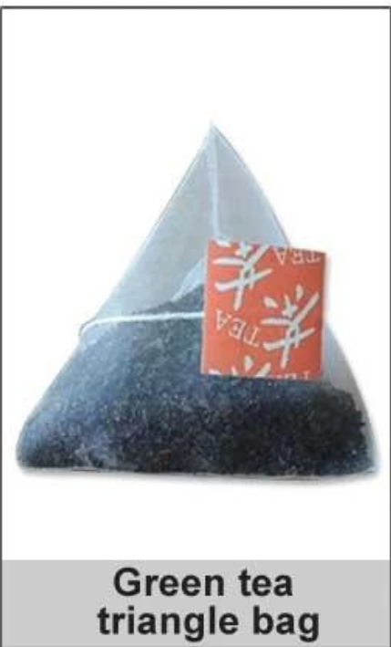
Green tea triangle bag