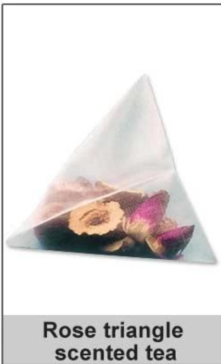
Rose triangle scented tea