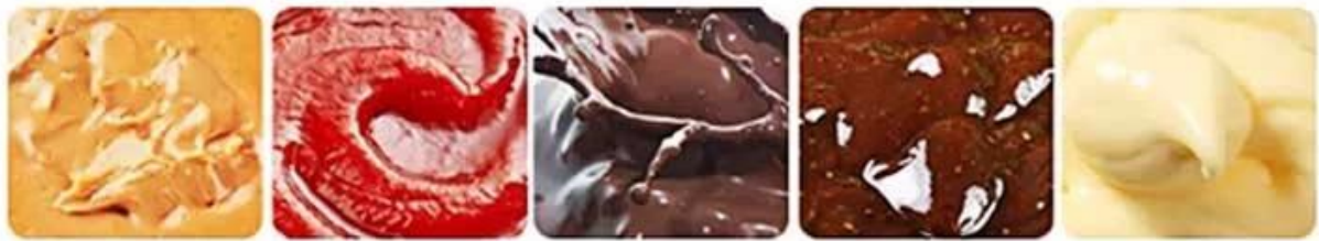
Sauce Ketchup Chocolate sauce Jam Cream