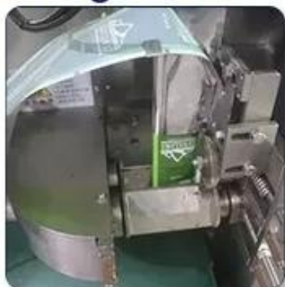
Outer bag sealing device