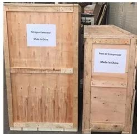
Wooden Box Packing