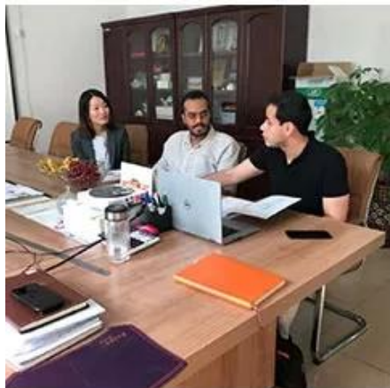
Collect Customer Needs