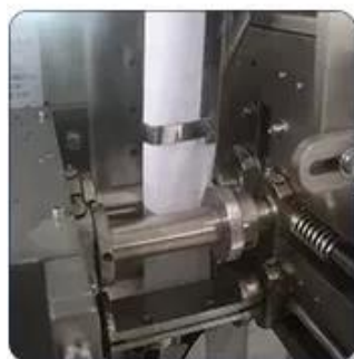
Inner bag sealing device