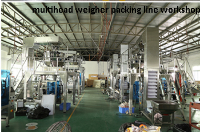
multihead weigher packing line workshop