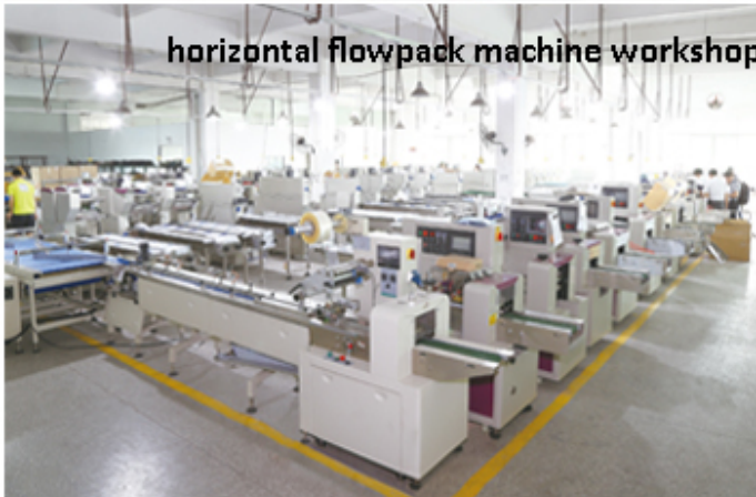
horizontal flowpack machine workshop