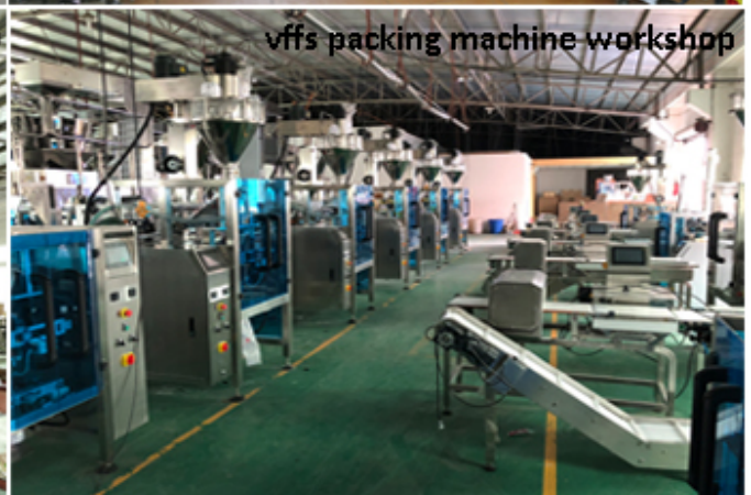
vffs packing machine workshop