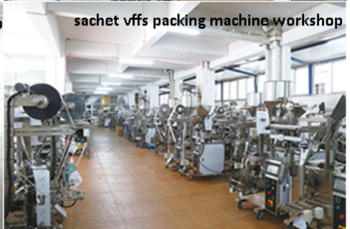
sachet vffs packing machine workshop