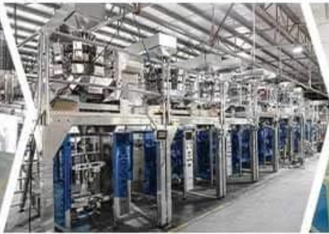
LARGE VERTICAL WORKSHOP