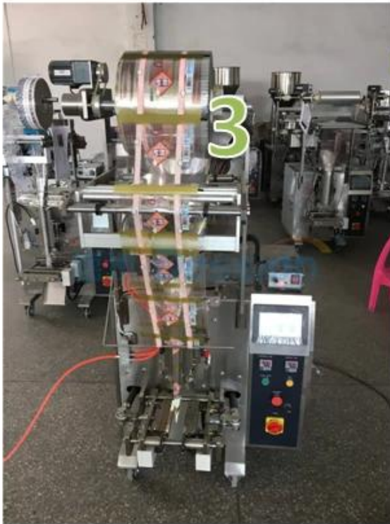
3. Film pulling