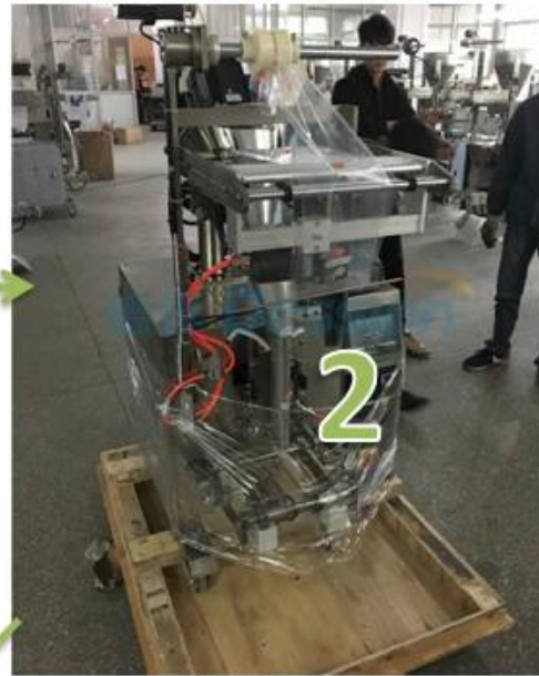
2. Wrapping the machine