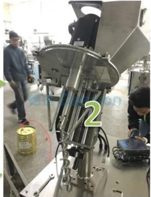
2. Screw/Auger Measuring