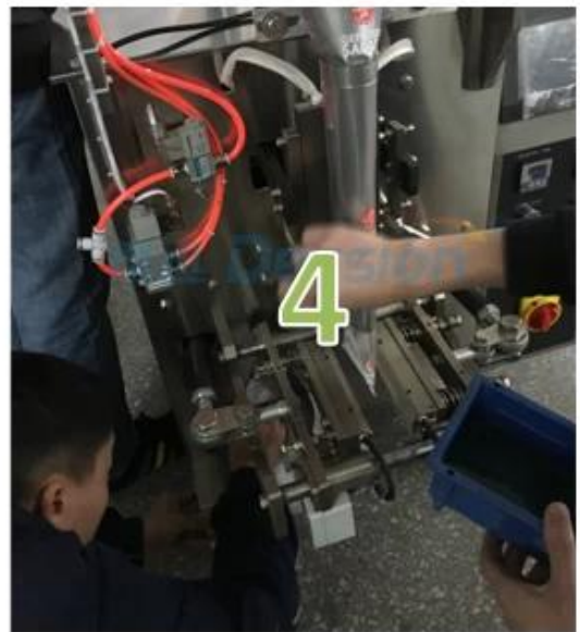
4. Back sealing bag making

Vffs is a type of packaging machine, used for filling and sealing bags.