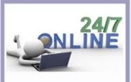
7-24 Hours services