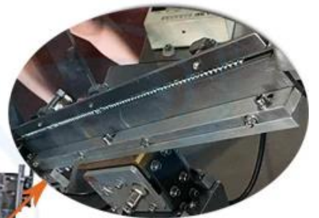
Precise Skid Trail