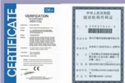
Tight quality control