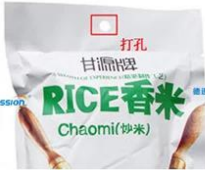
Round Punching Hole