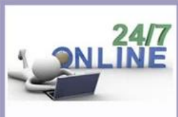
7-24 Hours services