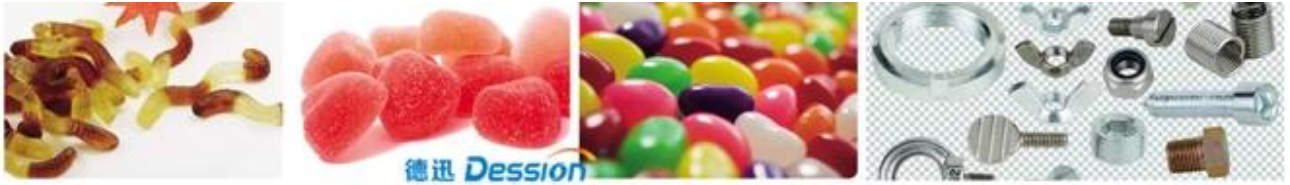
Form 1 (standard) Form 2 (optional) Form 3 (optional) Form 4 (optional) Form 5 (optional)