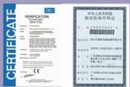
Tight quality control