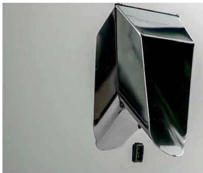
INFRARED INDUCTION HEAD

The transparent window allows you to monitor the cooking process without opening the door. It is made of high-quality tempered glass and is designed to withstand high temperatures. The window is 30cm wide.