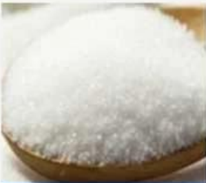
refined cane sugar