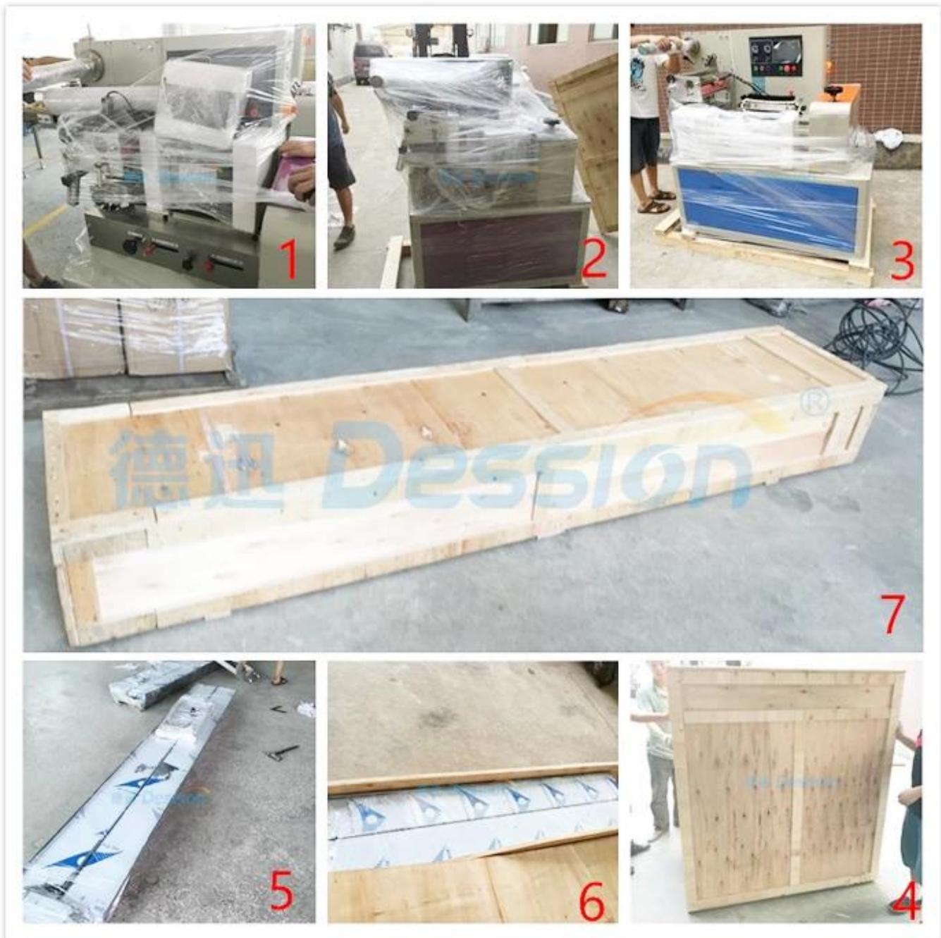
Automatic perforating tea bag and instant coffee machine packing